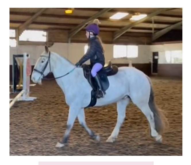
Fudge having a great time jumping!

In June some of our younger riders took part in the "have a go" jumping competition at Elms Farm and we were delighted at how they all coped, with some winning a rosette.