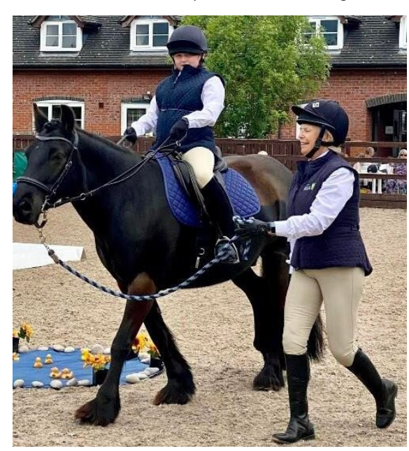
Rio with another of our riders

Face to face competitions are back this year which is wonderful. We entered a number of our riders into the Countryside Challenge at the Regional Qualifying Competition which took place in April and May at Scropton Horse Centre and were very thrilled when all of them qualified in the top five with two going on to compete in the RDA National Championships at Hartpury in July. We have also entered our wonderful boy Rio (pedigree name Lemonsholme Prince) into the "Showing" class at Hartpury and are hoping for a good result.