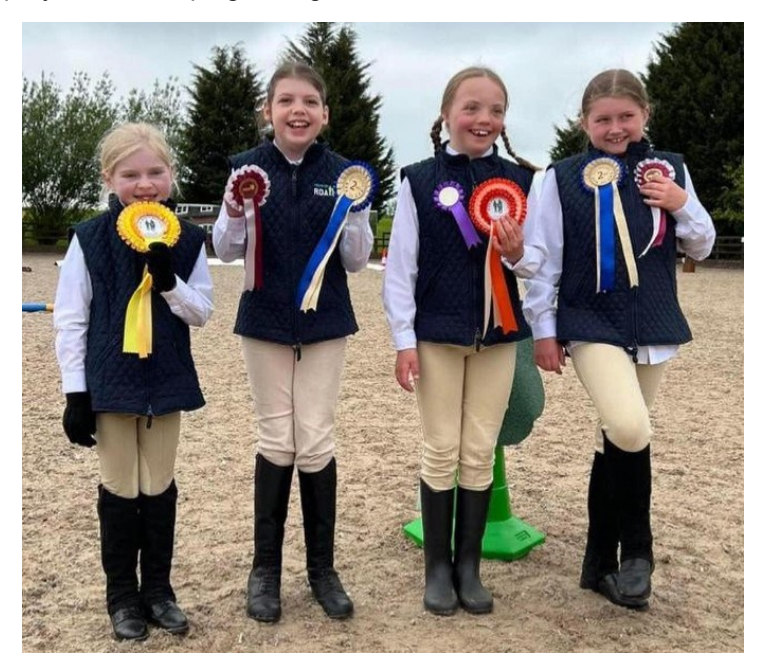
Our winning team with their well deserved rosettes