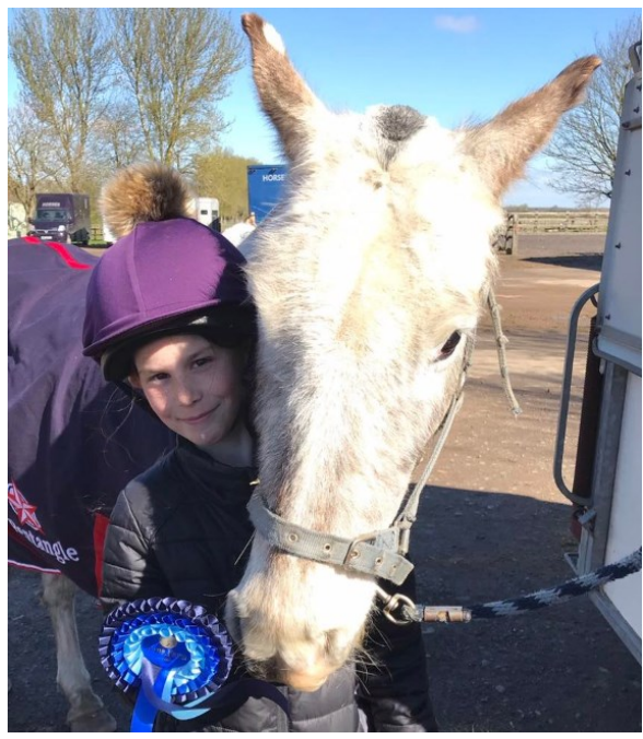
Fudge and his successful rider at Elms Farm