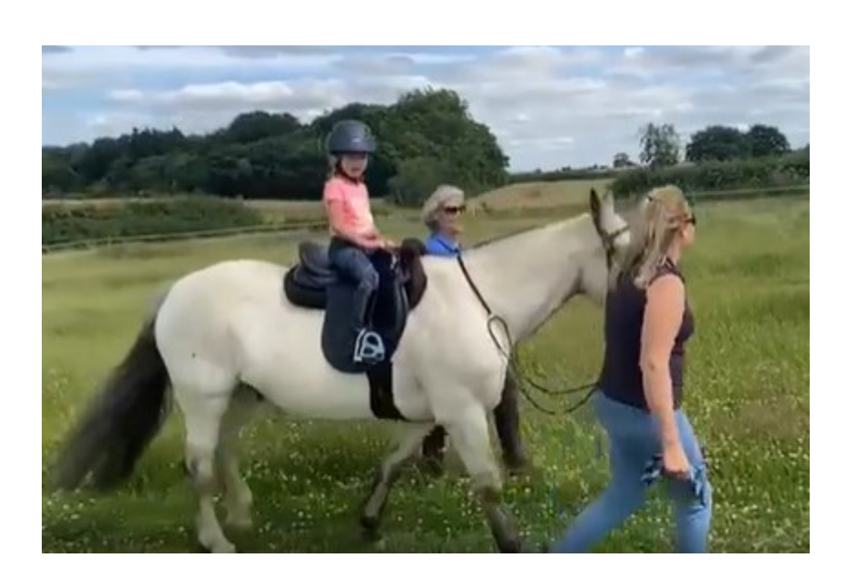
Enjoying a ride through one of our nature trails