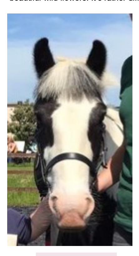
Bransby Mushu (Mu)

Now that the weather has improved we are taking advantage of our lovely position in the countryside and have mown paths through some our grassy meadows to set up an activity loop, nature loop and a "relax" loop for our riders. They really enjoy being out in the countryside and smelling the new mown grass as well as looking at all the beautiful wild flowers. It's rather different to riding in the arena!