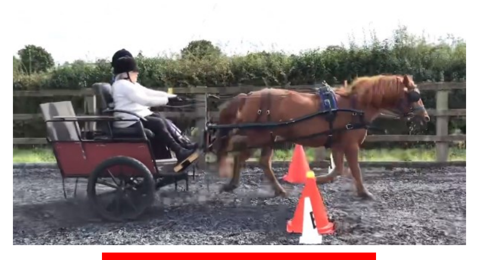
Sue and Pepsi driving around the obstacle course