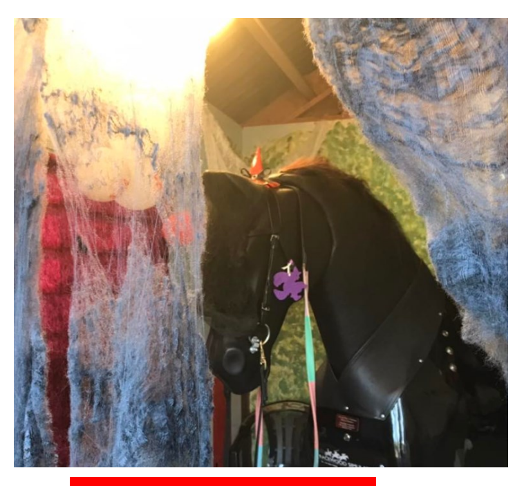
Spooky pumpkins and beastly bats!

We had as spooky time at the stables this October. Lots of scary activities; painting ponies, riding the scary simulator and lots of Halloween games. Even Rio got in on the act with this Devil's horns! He's a sweety although when he's 'off duty' he likes to think he's a bit of a Devil—he isn't!