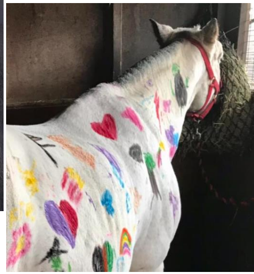
Fudge in his coat of many colours